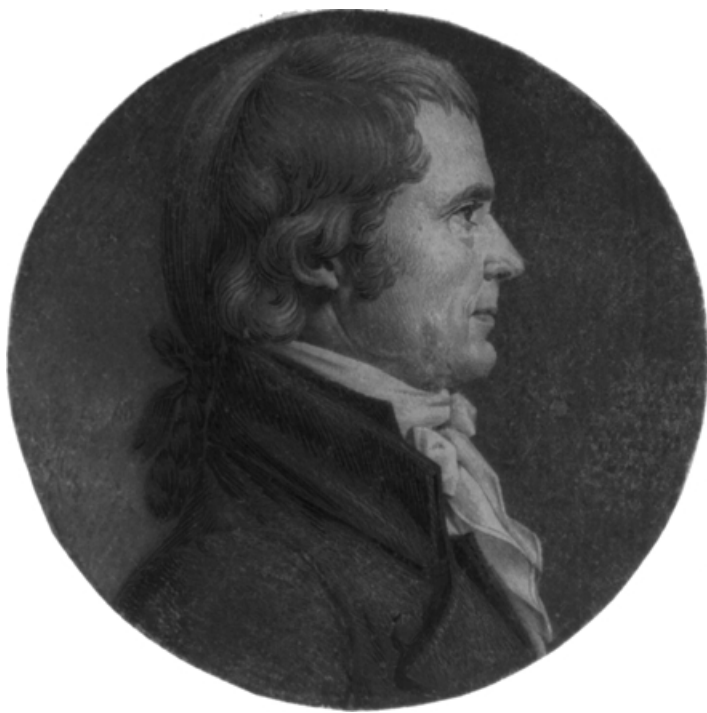
John Marshall, U.S. Supreme Court Chief Justice 1801–1835. Illustration: Library of Congress.

thwart consideration of the repeal of the Judiciary Act of 1801, the next term of the Supreme Court was set for February, 1803, meaning it could not meet until then (Morison 1965; Smelser 1968).